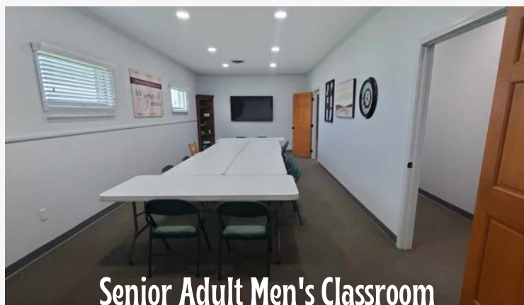
Senior Adult Men's Classroom