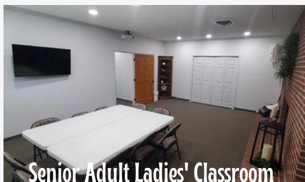
Senior Adult Ladies' Classroom