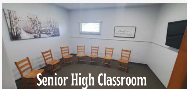
Senior High Classroom