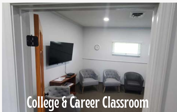
College & Career Classroom